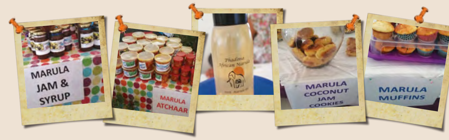
Marula products, made by different cooperatives in Mopani District Municipality, Limpopo

the creation of the Marula Festival over ten years ago by the Limpopo Economic Development, Environment and Tourism Department and the six year old Umthayi Marula Festival launched by the Tembe Traditional Authority in Northern KZN. Benchmarked on Octoberfest, the world's largest Volksfest (beer festival and travelling funfair) held annually in Munich, Bavaria, Germany, Marula and Umthayi Festivals are hinged on the celebration of the marula fruit, the beer and the livelihood uses of the fruit. In summary, the two festivals are an embodiment of cultural celebrations, heritage and economic beneficiation, music and entertainment and seek to bring the peoples of South Africa for a drink at a single point by the same calabash.