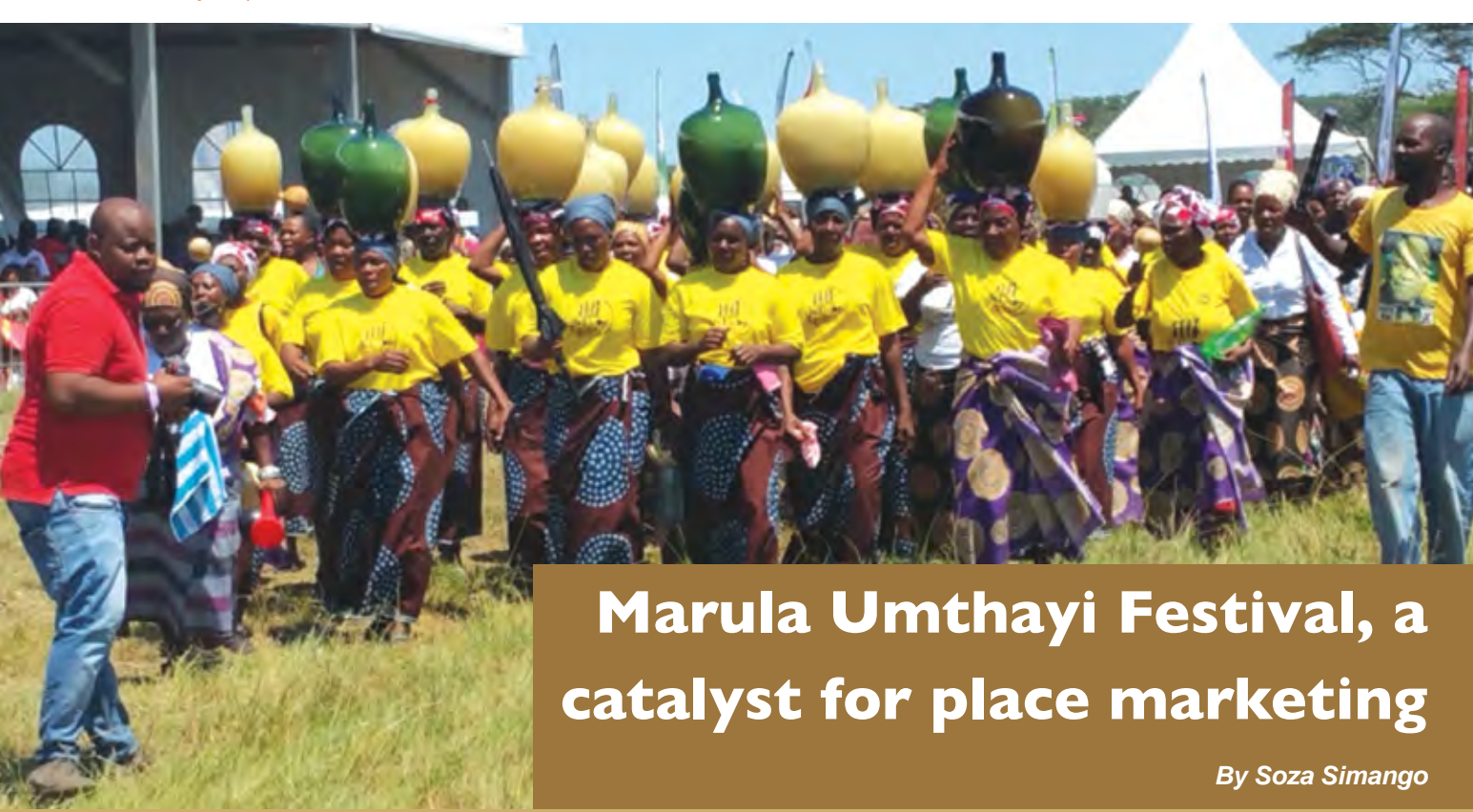
The local women in KwaNgwanase bringing the Marula beer to Inkosi Mabhudu Tembe II during the Umthayi Marula Festiva

t can only be through the ingenuity of human beings that the natural richness of the Marula tree which carries beer producing fruit and numerous by products in southern Africa could be transformed into a popular cultural festival that has for the past 10 years played a key role in driving domestic tourists to the otherwise unknown little town of Phalaborwa in Limpopo and the remote and rural region of Kwangwanase in Northern KwaZulu-Natal.